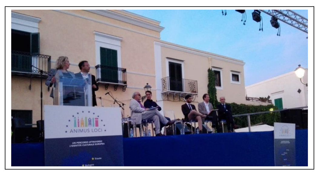
As testimony we report below the article of the online newspaper "Tempo Reale".

In 2018 the island also hosted the event of 'ANIMUS LOCI' organized together with the European Commission - Representation of Rome, which led the citizens of Ventotene to debate in Piazza Castello the hottest issues concerning staying in Europe.